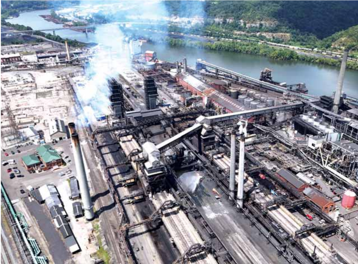
Smoke from the US Steel Clairton Coke Works in Clairton